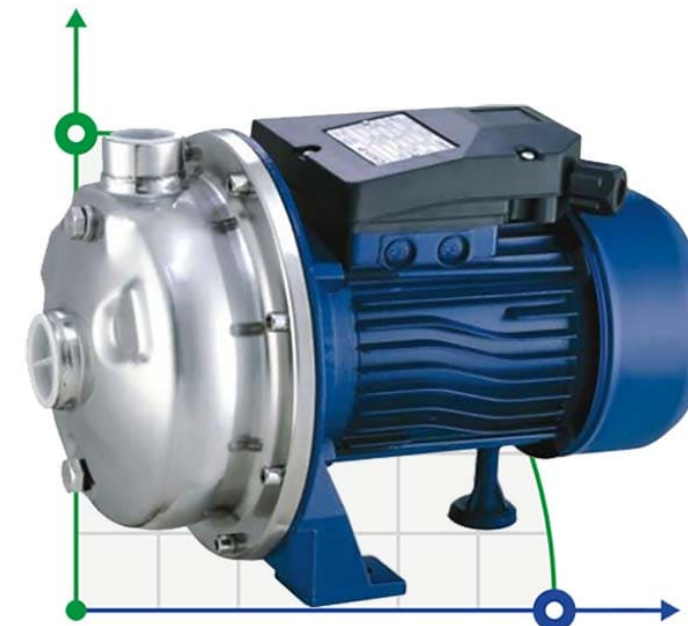
CD Centrifugal Pump