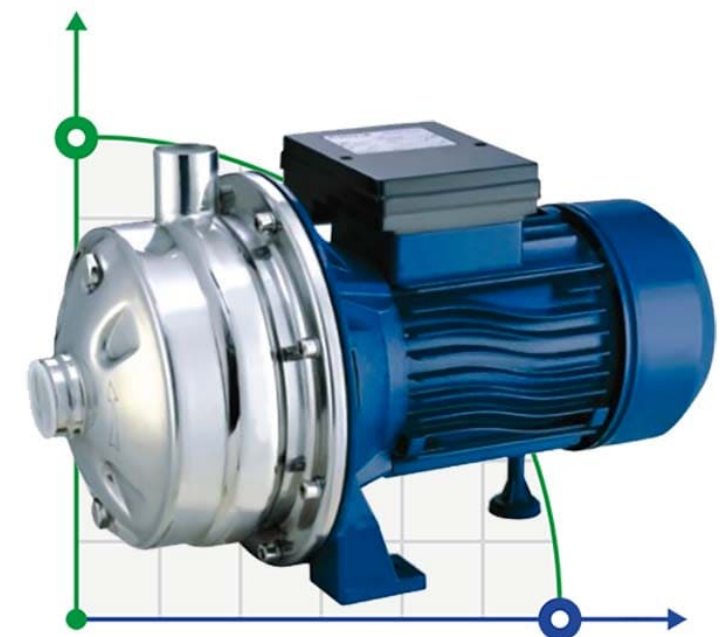
2CD Centrifugal Pump